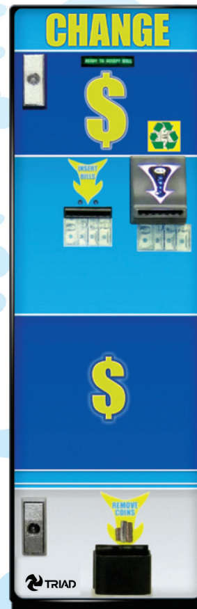
TRIAD 400 FRONT LOAD