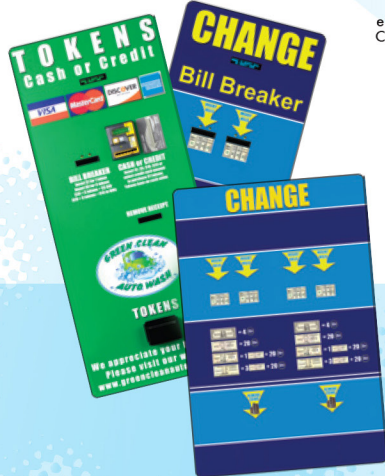
TRIAD's 400 REAR LOAD